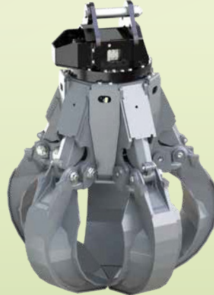
P30VHD Orange Peel Grabs Heavy Duty with 4 tines

Orange peel grab with 4 tines and 1.05c.y. volume for the handling of bulky scrap with excavators from 39600lbs to 55000lbs operating weight. Especially developed for heavy duty tasks.