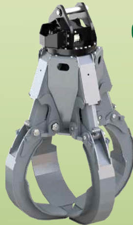
P51VHD Orange Peel Grabs Heavy Duty up to 50t / 110000lbs

Orange peel grab with 4 or 5 tines and 0.78c.y. or 1.05c.y. volume for the handling of bulky scrap with excavators with up to 88000lbs operating weight - for heavy duty tasks.