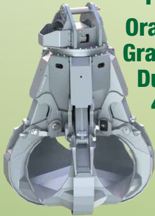
P40VHD Orange Peel Grabs Heavy Duty with 4 tines

Orange peel grab with 4 or 5 tines and 0.78c.y. or 1.05c.y. volume for the handling of bulky scrap with excavators from 44000lbs to 66000lbs operating weight - for heavy duty tasks.