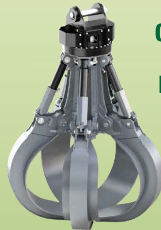
P80VHD Orange Peel Grabs Heavy Duty up to 80t / 176000lbs

Orange peel grab with 4 or 5 tines and 1.31c.y., 1.64c.y. or 1.96c.y. volume for the handling of bulky scrap with excavators from 79200lbs to 110000lbs operating weight - for heavy duty tasks.