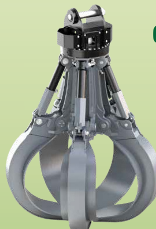
P80VHD Orange Peel Grabs Heavy Duty with 4 tines

Orange peel grab with 4 or 5 tines and 1.31c.y., 1.64c.y. or 1.96c.y. volume for the handling of bulky scrap with excavators from 79200lbs to 110000lbs operating weight - for heavy duty tasks.