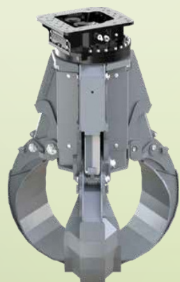
P25VR HD Orange Peel Grabs Heavy Duty with 4 tines

Orange peel grab with 4 tines and 1.05c.y. volume for the handling of bulky scrap with excavators from 39600lbs to 55000lbs operating weight. Especially developed for heavy duty tasks.