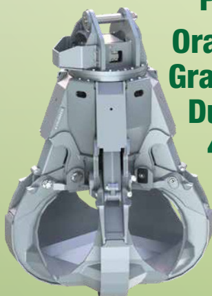
P40VHD Orange Peel Grabs Heavy Duty with 4 tines

Orange peel grab with 4 or 5 tines and 0.78c.y. or 1.05c.y. volume for the handling of bulky scrap with excavators from 44000lbs to 66000lbs operating weight - for heavy duty tasks.