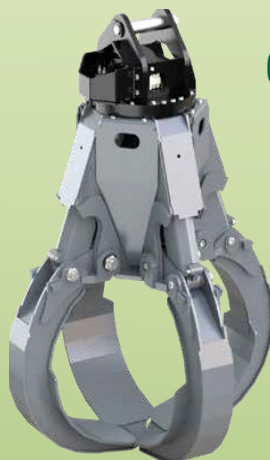
P51VHD Orange Peel Grabs Heavy Duty with 4 tines

Orange peel grab with 4 or 5 tines and 0.78c.y. or 1.05c.y. volume for the handling of bulky scrap with excavators with up to 88000lbs operating weight - for heavy duty tasks.