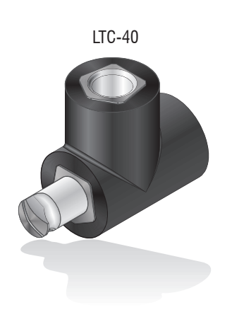
Optional - Connector covers may be private branded.

Colored covers make it easy to locate the connectors for field use. Also identify cable leads easily for contractors and field erectors.