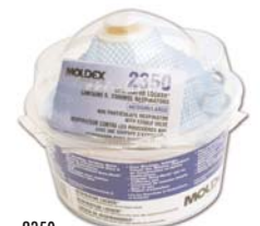
2350 Respirator Locker