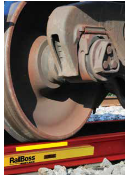
* Non Legal for Trade