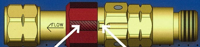
Locking Ring Aligned with Lock Tab for Release