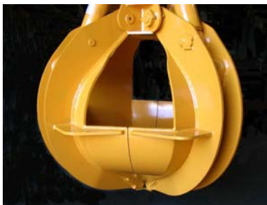
Optional: Fully enclosed tines