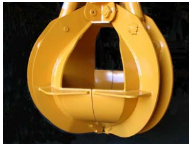
Optional: Fully enclosed tines